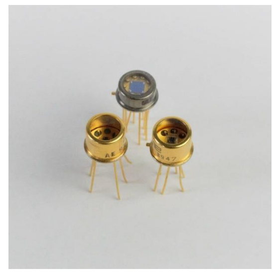
Silicon photodiodes in TO-housing