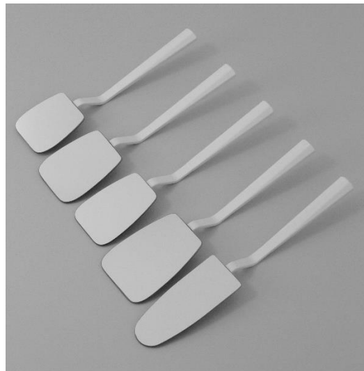
Mirrors small, medium, large and lateral